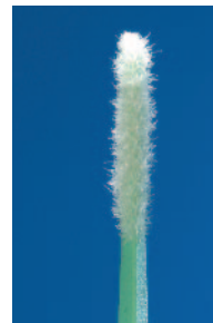
Den-Brush the fibrous edge.