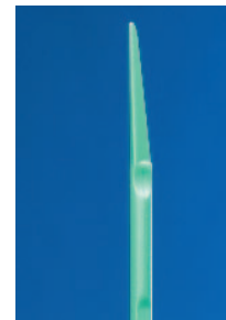
Den-Pick is identical to Den-Brush structural body without the fibers.