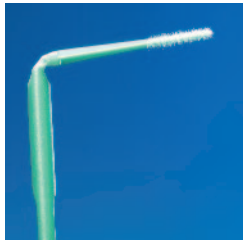
Bent position for desired angle.