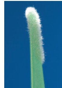
Den-Brush fibrous portion of both opposing side walls.