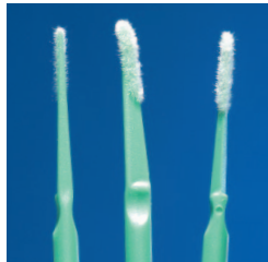
Coated tip fibrous bristles on 3 sides. Rounded end handle with two flat middle sides

There are two indentations in the handle portion to allow Den-Brush to bent into desired position. Both ends of the handle are rounded while the middle area consist of two flat sides for controlled and convenient holding position. Handle length allows the user to easily reach all areas of upper and lower jaw.