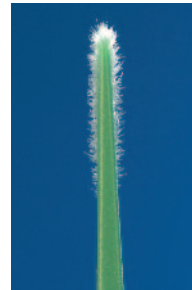
Den-Brush back wall or gum line void of fibers.